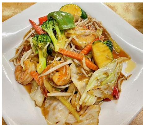
SF - 6