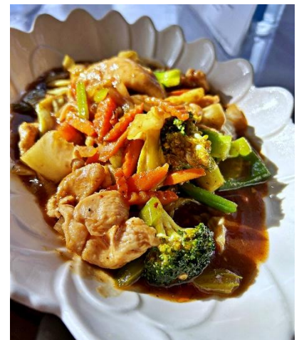
CD - 1