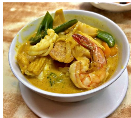
Golden Curry SF

*Gratuity Charges for groups of 6 or more