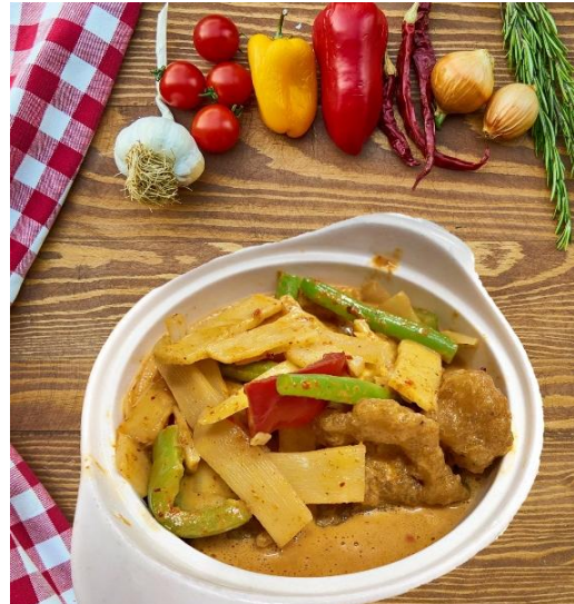
Red Curry 🌶️ $17.99 Bamboo shoot, baby corn, snap peas, onions, red & green peppers, and basil