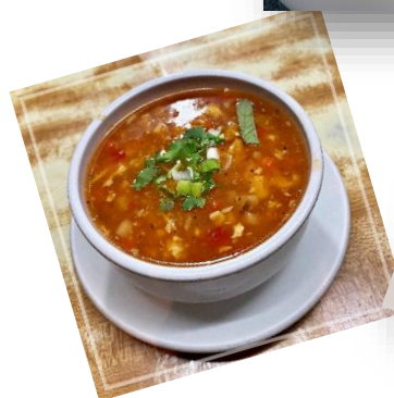
Hot n Sour