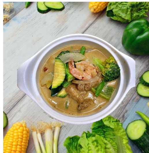
Evergreen Curry 🌶️ $17.99 Broccoli, zucchini, green peppers, snap peas, onion, and basil