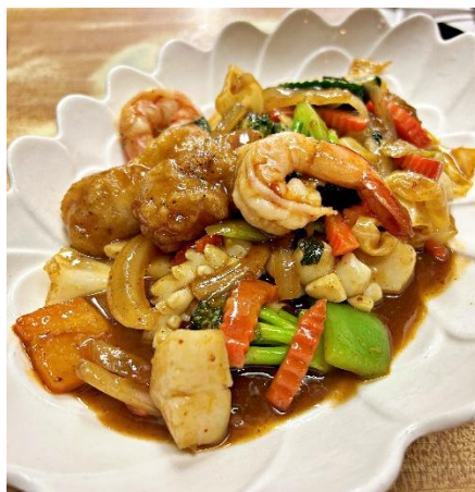
SF - 2