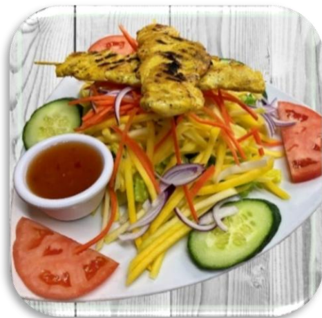
SL - 7

Refreshing salads with crisp lettuce, tomato, cucumber, carrot, added your choice of protein along with our home-made sauce.