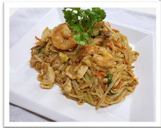
Chicken - Shrimp Curry Pad Thai