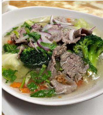
Beef VIET Soup