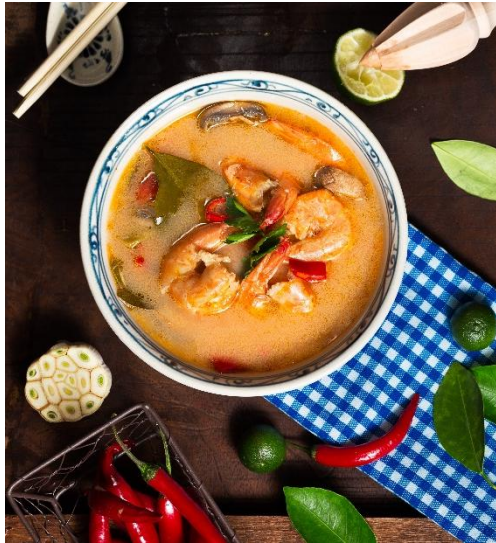
Panang Curry 🌶️ $17.99 Bamboo shoot, baby corn, snap peas, red & green peppers and basil leaves in panang curry sauce

ADD: Tofu: +$2.00 | Chicken: +$4.00 | Beef: +$5.00 | Shrimp: +$5.00 | Seafood: +$7.00