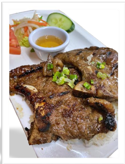
Grill Pork Chop