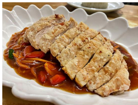
CD - 9