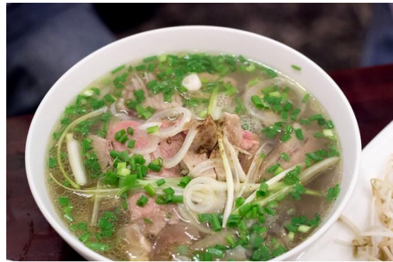
PHO Noodle Soup