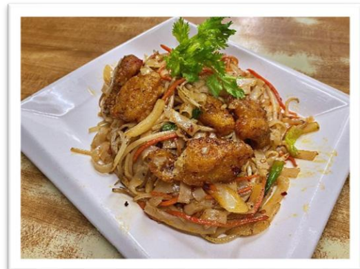
Seafood Satay Hofun