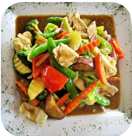
CD - 7