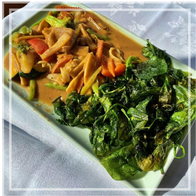
Crispy Spinach Veggie