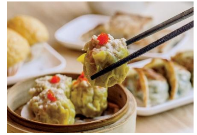
Pork Shiu Mai