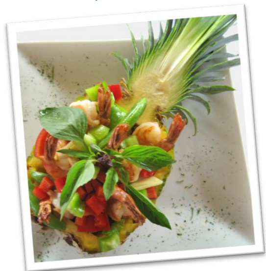
Shrimp Curry Pineapple