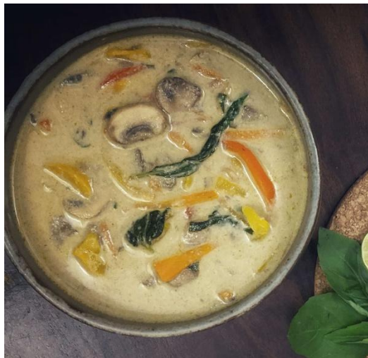
Golden Curry 🌶️ $17.99 Bamboo shoot, baby corn, snap peas, red & green peppers, onion, broccoli, mushroom, basil