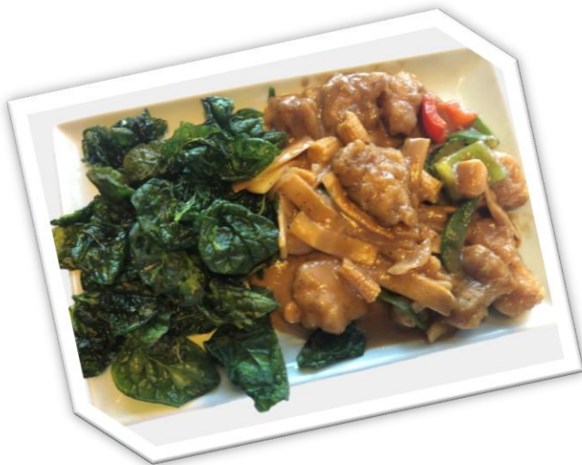
Fish Crispy Spinach